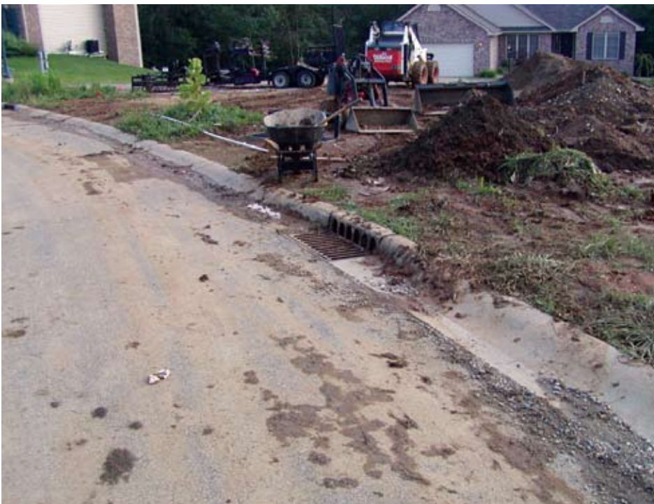
Sediment loss from a poorly managed construction site.