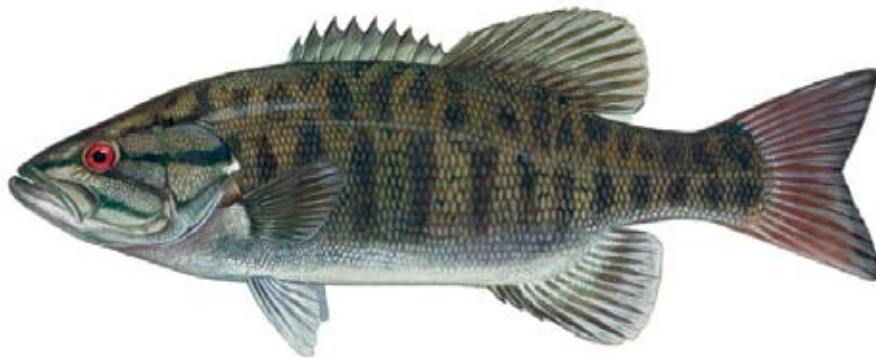
Smallmouth bass, part of the black bass family, are among the fish most affected by feminization of males.

The egg cells growing in the male fish's gonads can be seen only with a microscope after the fish has been caught and dissected. The study used data from 1995 to 2004, when the government stopped funding the research. The only river basin examined that did not show any problems was Alaska's Yukon River Basin.