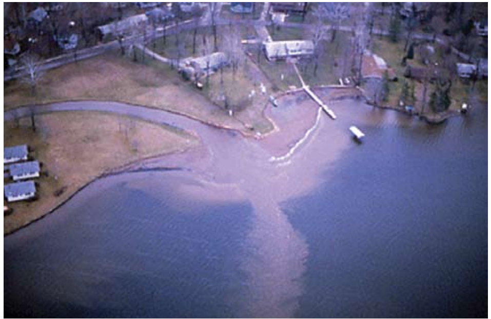
A plume of eroded soil from a construction site enters Winona Lake.

Nutrients transported by sediment can activate blue-green