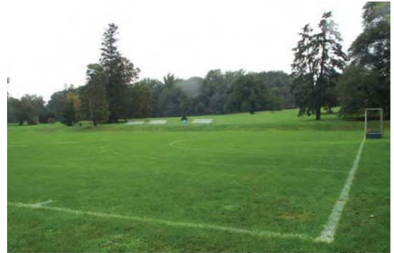
Pennsylvania Stormwater BMP Manual Athletic field to be used as a detention basin

A gate valve or orifice plate may be used to regulate the drawdown time. In general, the outflow structure should have an acceptable means of preventing clogging at the entrance to the structure over the design life to minimize maintenance requirements. The design must be designed within parameters required by the Stormwater Design and Specification Manual .