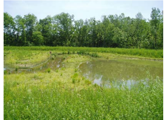
LONG, LINEAR, INTERCONNECTED BASIN

Detention Basins can be a cost effective method to provide temporary storage, conveyance, and treatment of runoff when used within the context of Low Impact Development (LID) strategies. Long, linear, interconnected basins can provide the designer with an economically attractive method to provide source control of stormwater as well as convey water without the slope and cover requirements of conventional storm sewer design. This allows for the drainage of the proposed development to more closely mimic existing conditions, minimizing earth work and the ecological impact to downstream receiving bodies. Further, the associated open vegetated aesthetics can provide for passive recreation, quality of life, and increase property values.