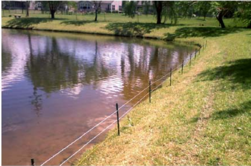
WET AND/OR DRY POND EDGE OPTIONS- CONVENTIONAL TURF EDGE

Surface vegetation in the basin provides erosion control, sediment entrapment, aesthetic value, and acts as a water fowl (Canadian Geese) deterrent. The images below demonstrate a traditional detention pond planted with turf grass, which does not provide the above items, and a detention pond edge planted with native forbes and grasses. Side slopes, berms, and basin surface should be planted with species concurrent with expected hydrologic conditions. Appropriate species can be found in Chapter 5: Stormwater Landscape Guidance.