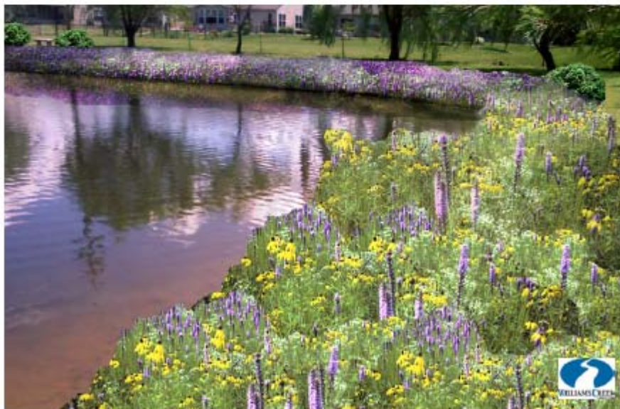
WET AND/OR DRY POND EDGE OPTIONS- NATIVE FORB AND GRASS EDGE